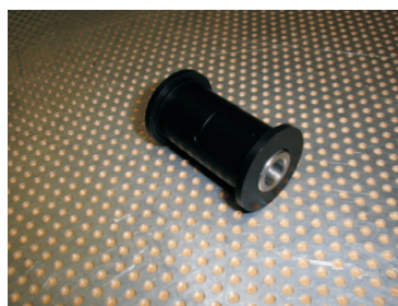
79-102H Bush Assembly