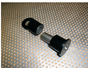
79-102H Single part showing glacier bearing

The bush is located on the rear of the front upper wishbone next to the exhaust. As such, each kit is supplied with heat shielding which protects the bush from the heat of the exhaust. The heat shield is simply wrapped around the chassis member near the exhaust and held in place with the supplied jubilee clip - see photos below. Use caution when handling the heat shield as it contains woven fibreglass cloth. Each heat shield measures 280x200mm.