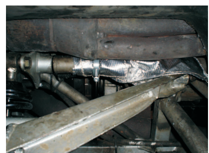
79-102H Heat shield installation (UK car - passenger side)